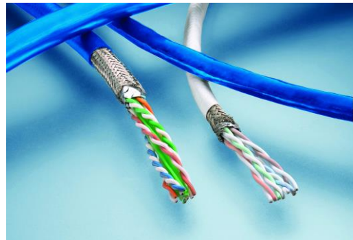
Figure 1. Aerospace applications are increasing using well-established commercial protocols for high-speed data transfers.

largely determines allowable cable distances (assuming crosstalk goals are met).